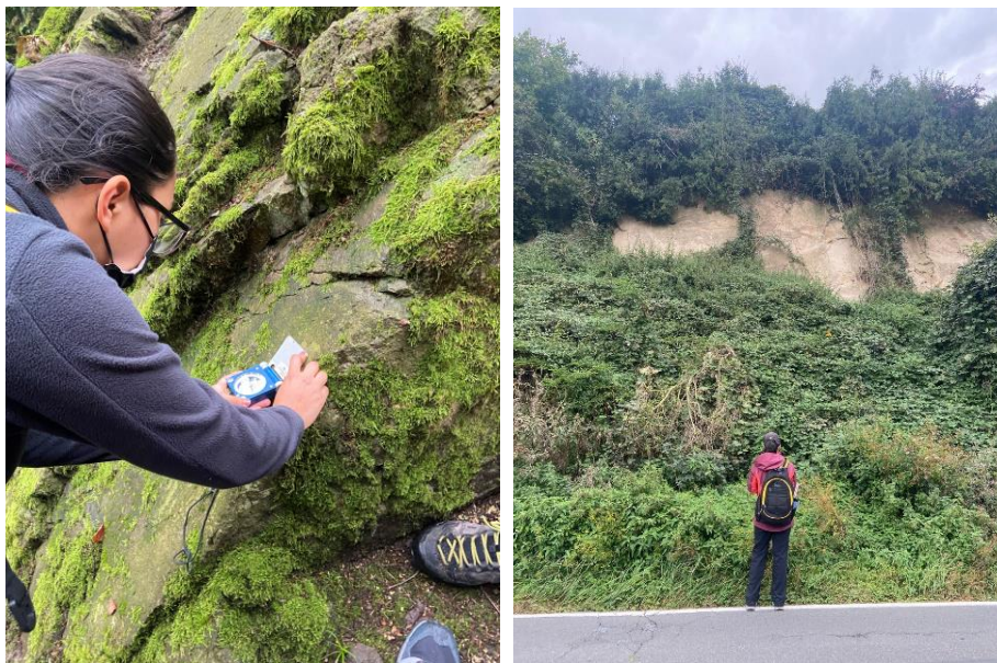
Figure 2. Fieldtrip to Brohltal Area.

One aspect I really like about the fieldtrips in Uni Bonn is that you are more independent regarding to the mapping task. They gave us a certain area that we, as a group, must map and determine the lithologies and its characteristics in a few days. The tutors and the main professor are willing to help if we have questions, but they will not be with us during the whole mapping activity. This experience has growth in me more independence and self confidence when it comes about being sure of my knowledge in geology, helped me in decision-making, and in reading more the literature given instead of just ask everything to the professor.