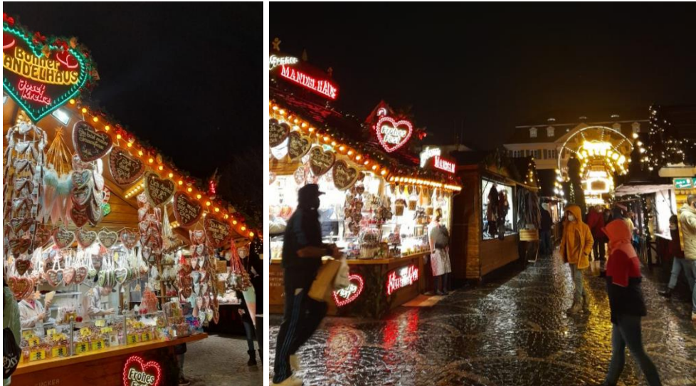
Figure 4. The Christmas market in the city center.

Even though I spent most of my months in Germany studying, I was able to do some travelling to the countries nearby. That is something I like about Europe, you can easily go to another country by travelling a couple hours by train or taking a bus. I visited a few cities in Belgium, Amsterdam in Holand, Paris and the North of France, and, of course, some cities in Germany. Despite it is still Europe, the customs of each country and city is different to the neighbour city. Also, the language changed drastically from one country to another so I had to put into use the handful expressions I have learned of each language.