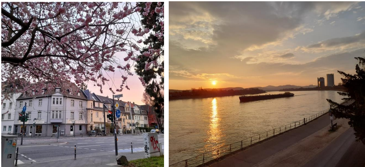
Figure 6. Last morning walks in Bonn.