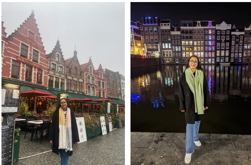
Figure 5. Some of my personal favourite trips to Brugge and Amsterdam.

It has been such a pleasure to visit the old continent and be able to walk around cities full of history, visit museums, and watch the remanents of the biggest events and cultures that have occured in the world. By being on the “crime scene”, it gives you a new perspective of the history and the way you see things that you just learned from the books or school.